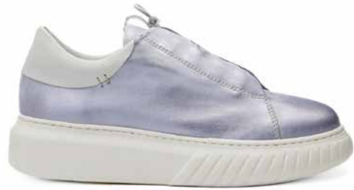
LIBI CUT SOLE MAXY COLOR CREAM LEATHER-1 BRUSHED COLOR LILAC LEATHER-2 DREAMER COLOR WHITE