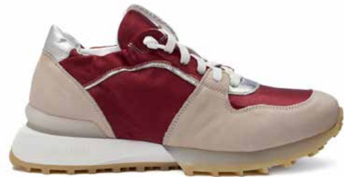
RUFFLE SAT SOLE TRICO COLOR TRANSPARENT LEATHER-1 NABUK COLOR FARD LEATHER-2 WASHED SATIN COLOR WINE