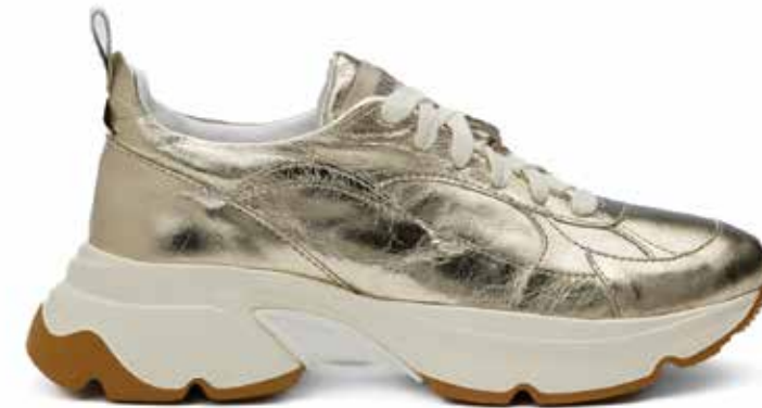
BIG RUN UNI SOLE SNIKY ROL COLOR CREAM/PEARL LEATHER-1 CHAMPION COLOR GOLD