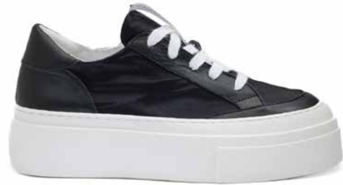
IZAR SATIN SOLE MARGY COLOR OFF-WHITE LEATHER-1 DREAMER COLOR BLACK LEATHER-2 WASHED SATIN COLOR BLACK