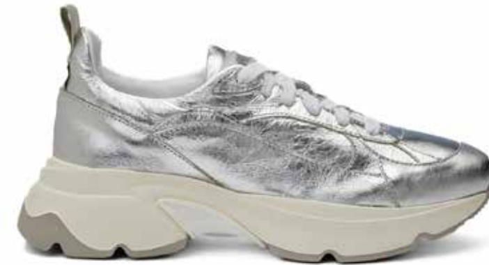
BIG RUN UNI SOLE SNIKY ROL COLOR CREAM/PEARL LEATHER-1 CHAMPION COLOR SILVER