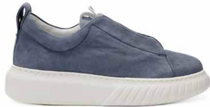
LIBI UNI SOLE MAXY COLOR CREAM LEATHER NABUK COLOR DENIM