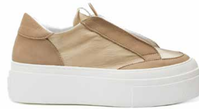
IVOR SATIN SOLE MARGY COLOR OFF-WHITE LEATHER-1 NABUK COLOR TAUPE LEATHER-2 WASHED SATIN COLOR BEIGE