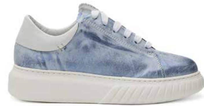
ZOE CUT SOLE MAXY COLOR CREAM LEATHER-1 BRUSHED COLOR JEANS LEATHER-2 DREAMER COLOR WHITE