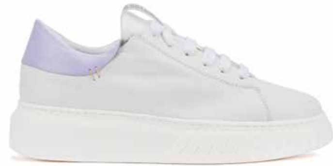
ZOE ENTRY SOLE MAXY COLOR CREAM LEATHER-1 DREAMER COLOR WHITE LEATHER-2 DREAMER COLOR LILAC