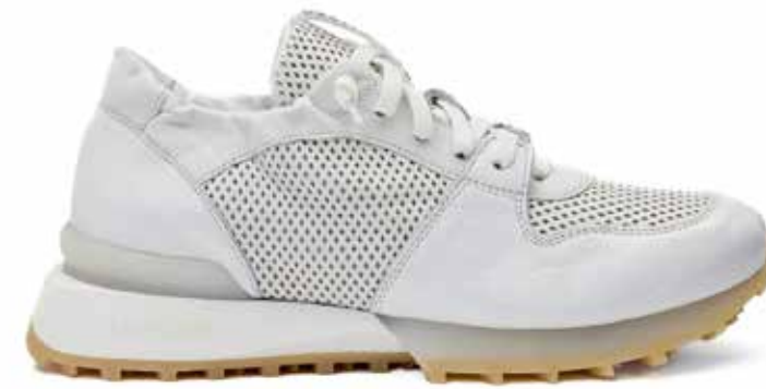
RUFFLE OPEN SOLE TRICO COLOR TRANSPARENT LEATHER-1 NAPLAK COLOR WHITE LEATHER-2 KITE COLOR WHITE