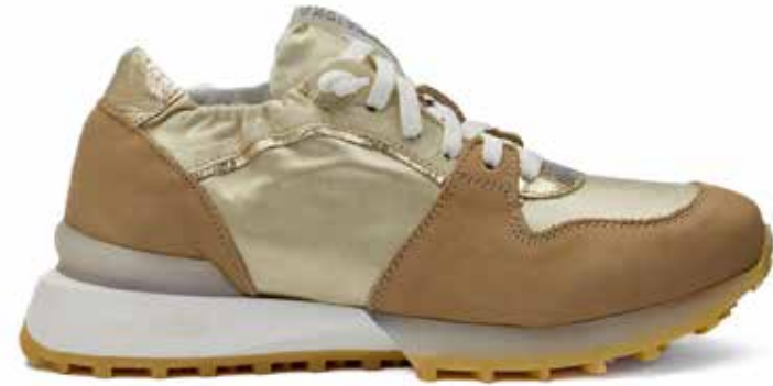
RUFFLE SAT SOLE TRICO COLOR TRANSPARENT LEATHER-1 NABUK COLOR TAUPE LEATHER-2 WASHED SATIN COLOR NATURAL