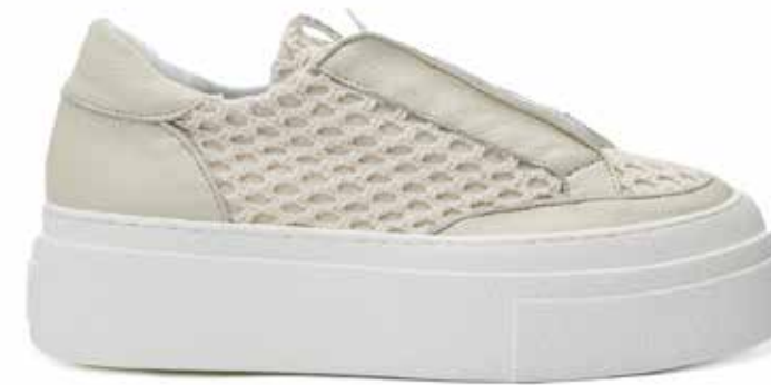
IVOR CROCHET SOLE MARGY COLOR OFF-WHITE LEATHER-1 DREAMER COLOR ICE LEATHER-2 CROCHET COLOR CREAM