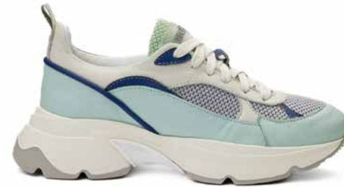
BIG RUN RICE SOLE SNIKY ROL COLOR CREAM/PEARL LEATHER-1 DREAMER COLOR POOL LEATHER-2 RICE COLOR GREY