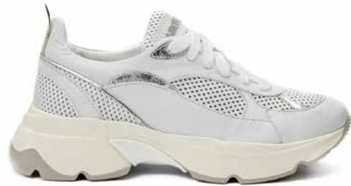
BIG RUN KITE SOLE SNIKY ROL COLOR CREAM/PEARL LEATHER-1 DREAMER COLOR WHITE LEATHER-2 KITE COLOR WHITE