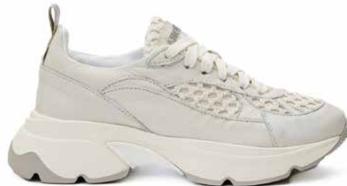
BIG RUN CROCHET SOLE SNIKY ROL COLOR CREAM/PEARL LEATHER-1 DREAMER COLOR ICE LEATHER-2 CROCHET COLOR CREAM