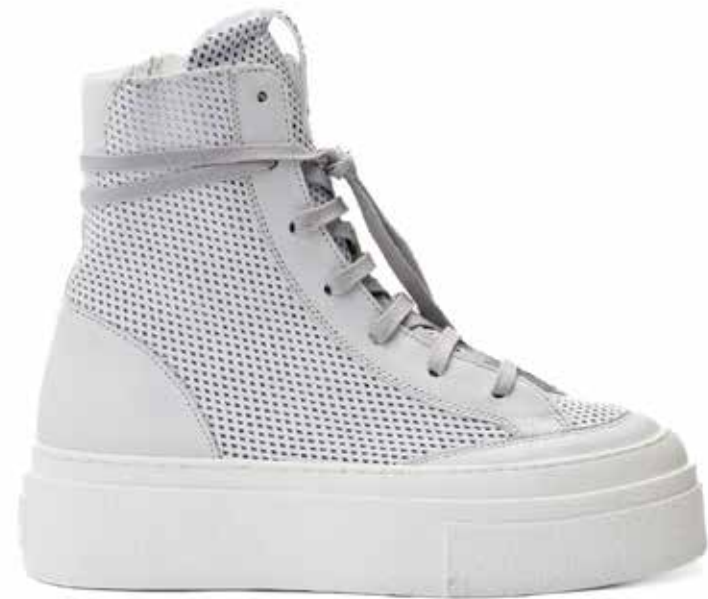
EILON KITE SOLE MARGY COLOR OFF-WHITE LEATHER-1 DREAMER COLOR WHITE LEATHER-2 KITE COLOR WHITE