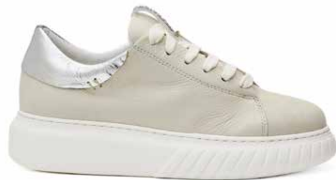
ZOE CUT SOLE MAXY COLOR CREAM LEATHER-1 NABUK COLOR ICE LEATHER-2 CHAMPION COLOR SILVER