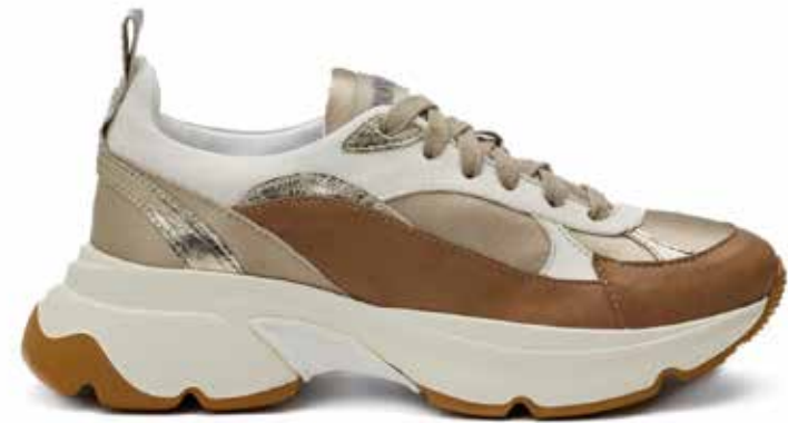
BIG RUN MULTI SOLE SNIKY ROL COLOR CREAM/PEARL LEATHER-1 DREAMER COLOR WOOD LEATHER-2 WASHED SATIN COLOR BEIGE