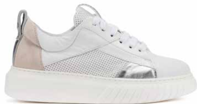
ELEN PATCH SOLE MAXY COLOR CREAM LEATHER-1 DREAMER COLOR WHITE LEATHER-2 DRILL COLOR WHITE