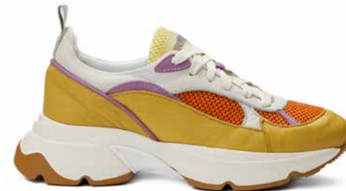
BIG RUN RICE SOLE SNIKY ROL COLOR CREAM/PEARL LEATHER-1 DREAMER COLOR OCRE LEATHER-2 RICE COLOR ORANGE