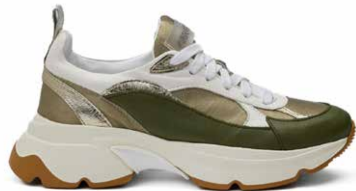
BIG RUN MULTI SOLE SNIKY ROL COLOR CREAM/PEARL LEATHER-1 DREAMER COLOR MILITARY LEATHER-2 WASHED SATIN COLOR SAGE