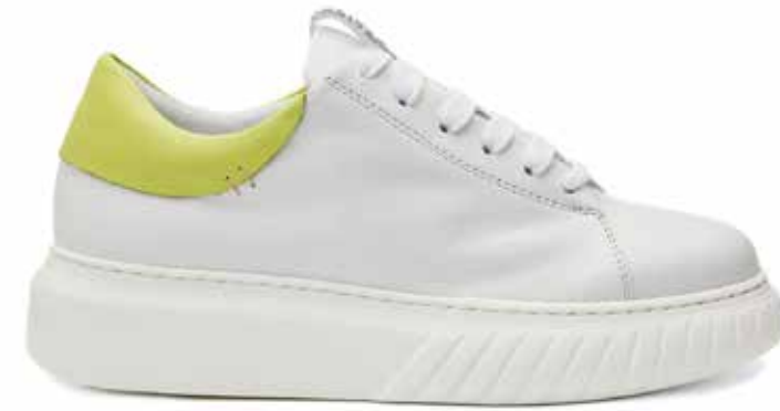
ZOE ENTRY SOLE MAXY COLOR CREAM LEATHER-1 DREAMER COLOR WHITE LEATHER-2 DREAMER COLOR CEDER