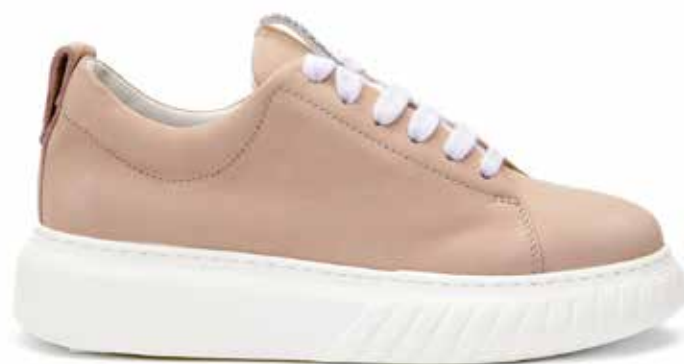
ELEN UNI SOLE MAXI COLOR CREAM LEATHER NABUK COLOR FARD